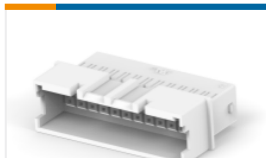
TE Part # 2-2324582-4 HSG,REC,FREE-HANGING,DUALROW,EP2.5