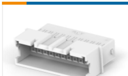
TE Part # 2-2324582-2 HSG,REC,FREE-HANGING,DUALROW,EP2.5